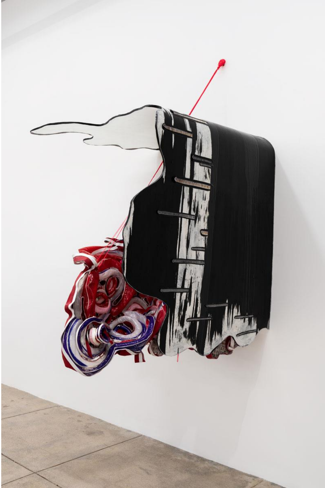
© Alicia Piller, Second nature. Looking for obstacles. Air hangs heavy with promise. (side view 2) , 2019, Mixed media