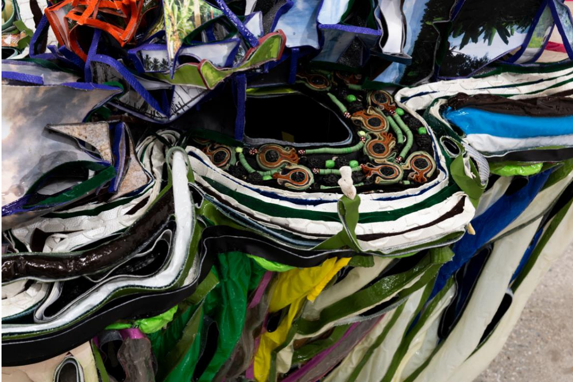
© Alicia Piller, Deep Space to navigate. States of magic. (detail) 2019, Mixed media