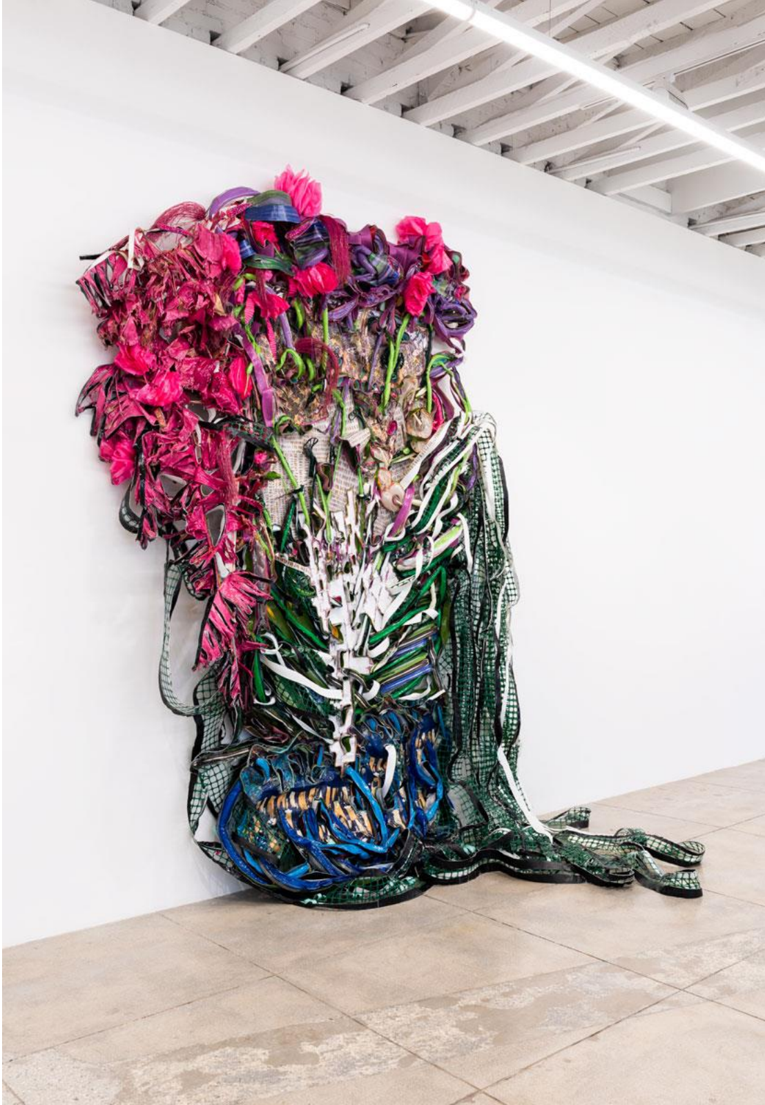
© Alicia Piller, Nature of a stately being. Outstretched arms, bursting with newborn stars. (side view) 2019, Mixed media