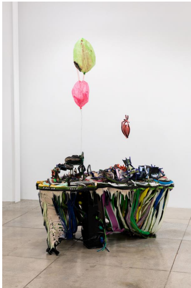
© Alicia Piller, Deep Space to navigate. States of magic. 2019, Mixed media